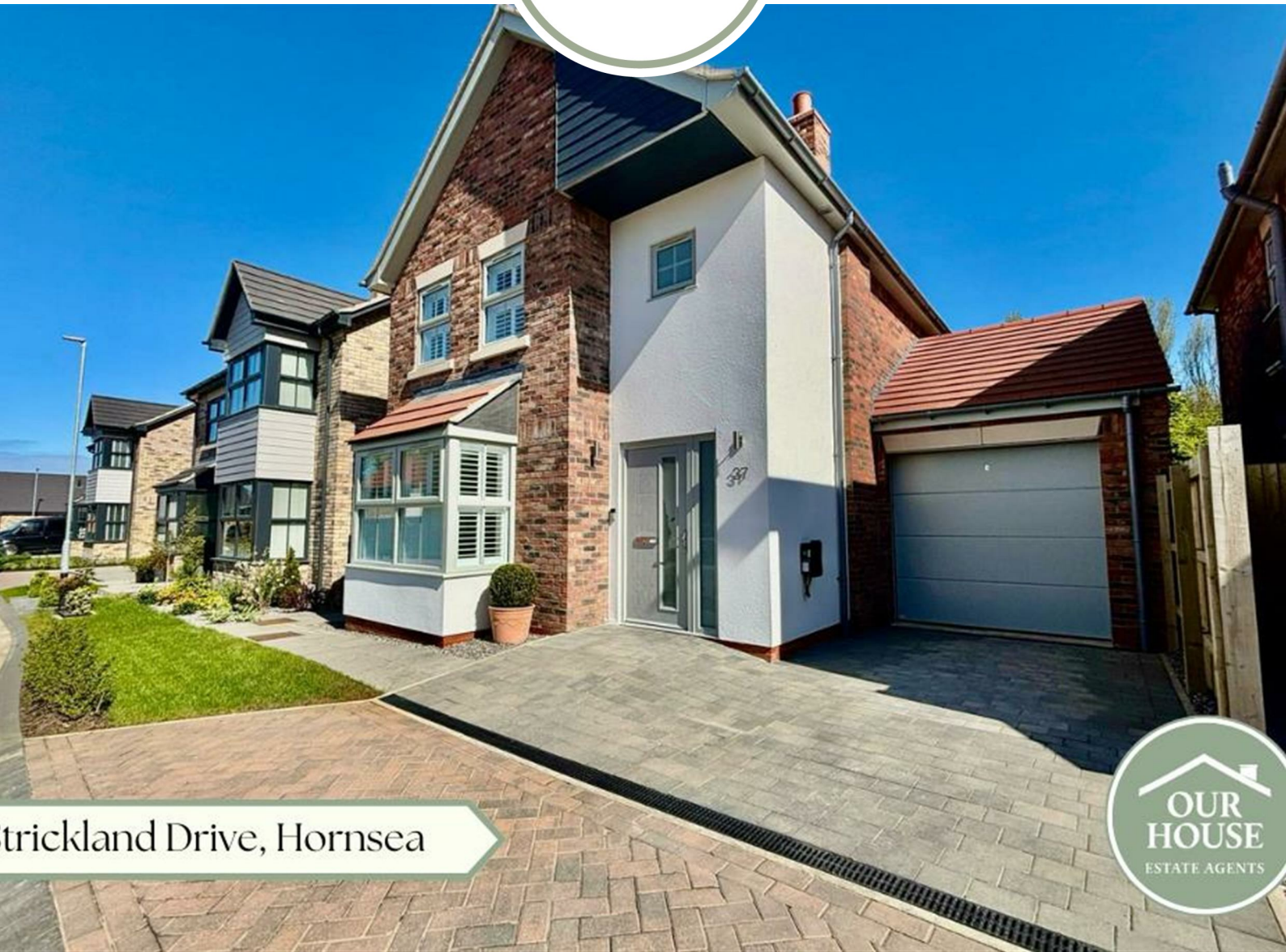
Strickland Drive, Hornsea